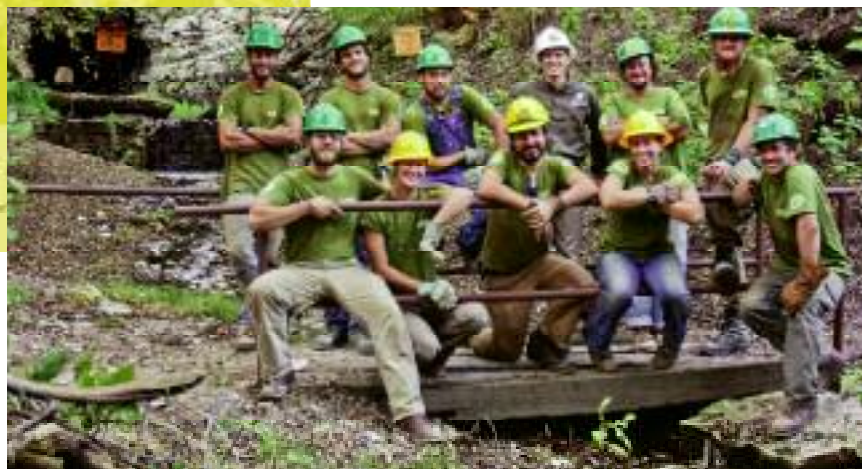
BELOW: The E-Corps crew takes a break for a group portrait at Old Tunnel Wildlife Management Area.

For the Trails Across Texas crew at Old Tunnel, the work day is ending. The tools are put away, the crew is drifting slowly back to their campsite, and there's a sense of camaraderie in the air as palpable and timeless as the trees and rocks and flowing water of this place that has been designed more by nature's hand than by man's. The bats will emerge in half an hour, but for now there are just the vestiges of the past — triumphs and disappointments alike — and the brightness of things to come. ★